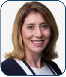
HON RITA SAFFIOTI MLA, DEPUTY PREMIER; MINISTER FOR TOURISM AND HON DON PUNCH MLA, MINISTER FOR REGIONAL DEVELOPMENT